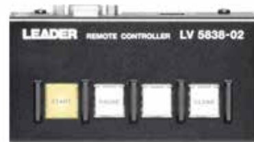
LV5838-02 Simple Loudness Remote Controller Option