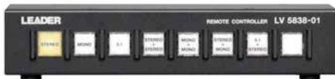
LV5838-01 Remote Controller Option